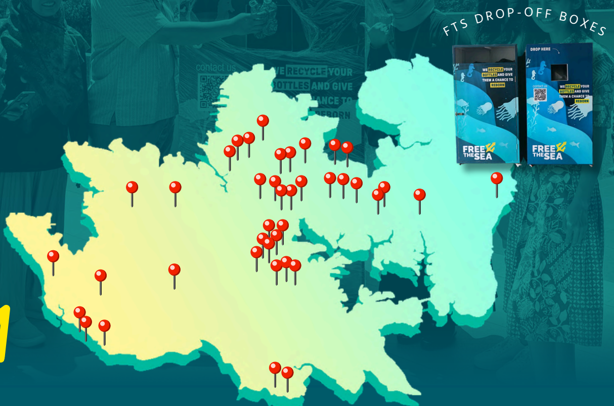
Map of Collection Partners by the end of 2024

By engaging these organizations, we extend the reach of our Collection Ecosystem and help promote better waste practices among their employees and customers, and the wider public.