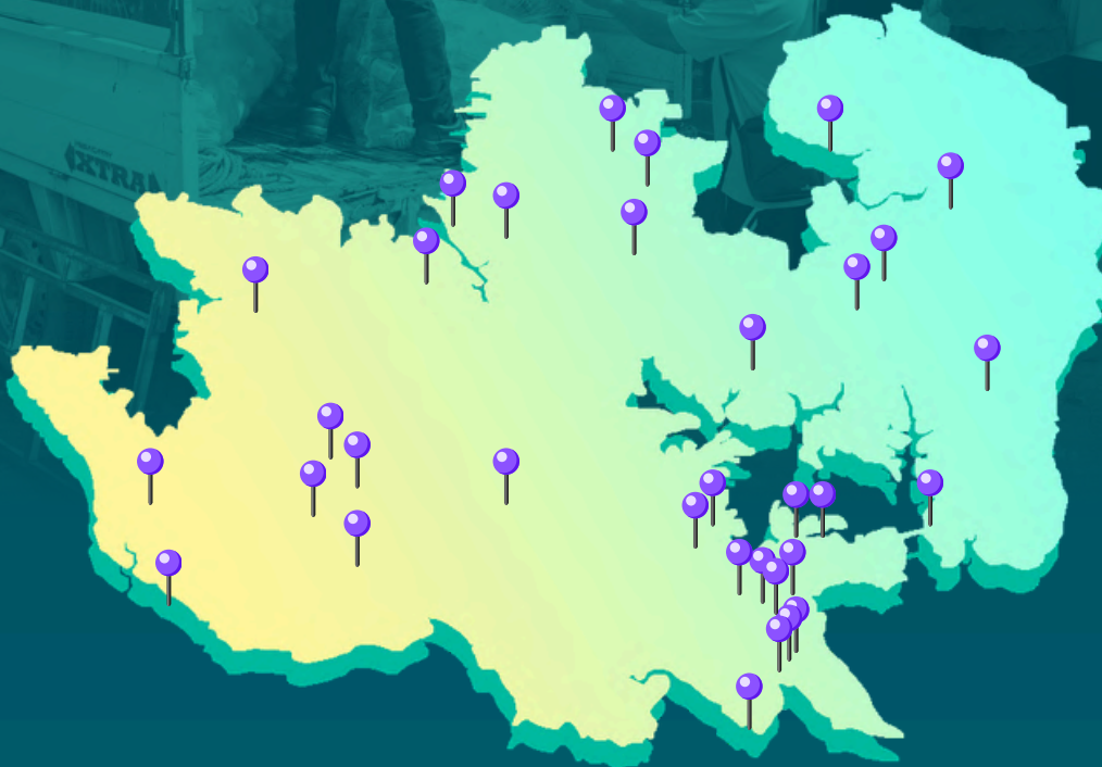
Map of Collection Points by the end of 2024

Beyond collection, they are also central to the pre-sorting process, ensuring that plastic waste is properly segregated and ready for recycling at our facility.